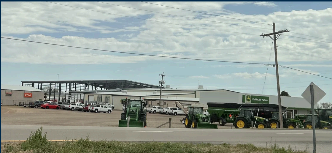
PrairieLand Partners Training Facility Expansion